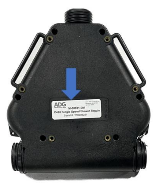
Serial Number Label Is Located On The Bottom OF The C420

We take the performance of our products very seriously and, accordingly, are taking all actions necessary to correct any potential performance inadequacies and deliver or return high quality units to you as rapidly as possible.